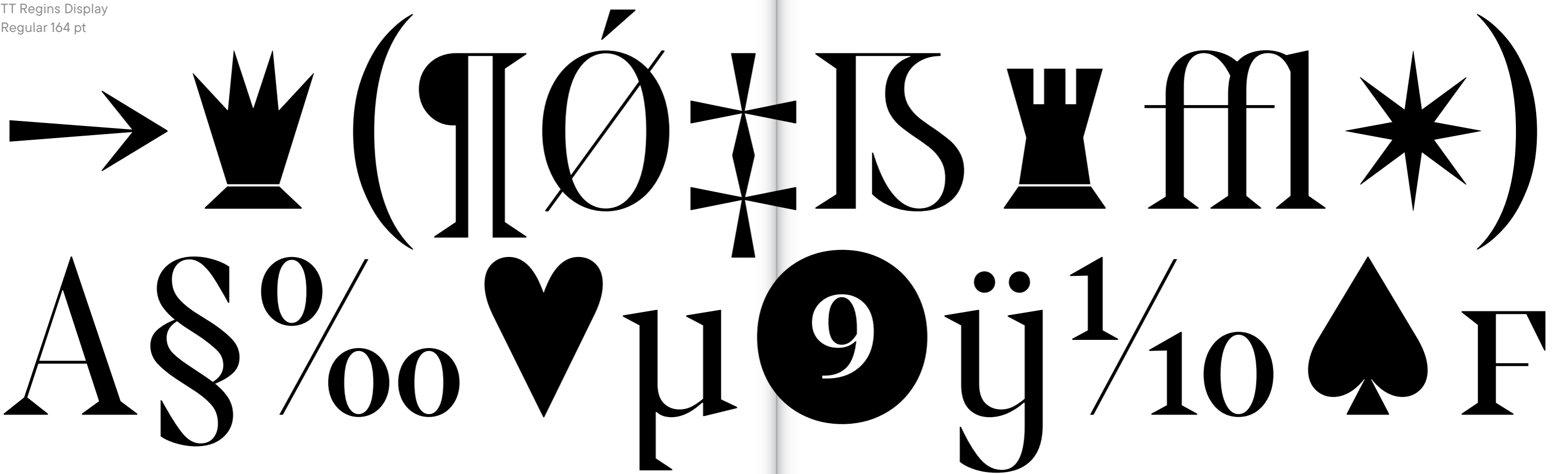
TT Regins Display Regular 164 pt