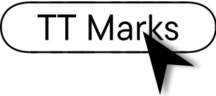
TT Marks Bold 268 pt

This versatile typeface shines in branding and packaging projects, elevates book and magazine covers, and creates show-stopping impact at display sizes on posters and billboards. TT Marks infuses projects with vintage appeal and handcrafted warmth that feels genuinely human. When used in hospitality settings like restaurant or café branding, it effortlessly evokes the inviting atmosphere of beloved American diners.