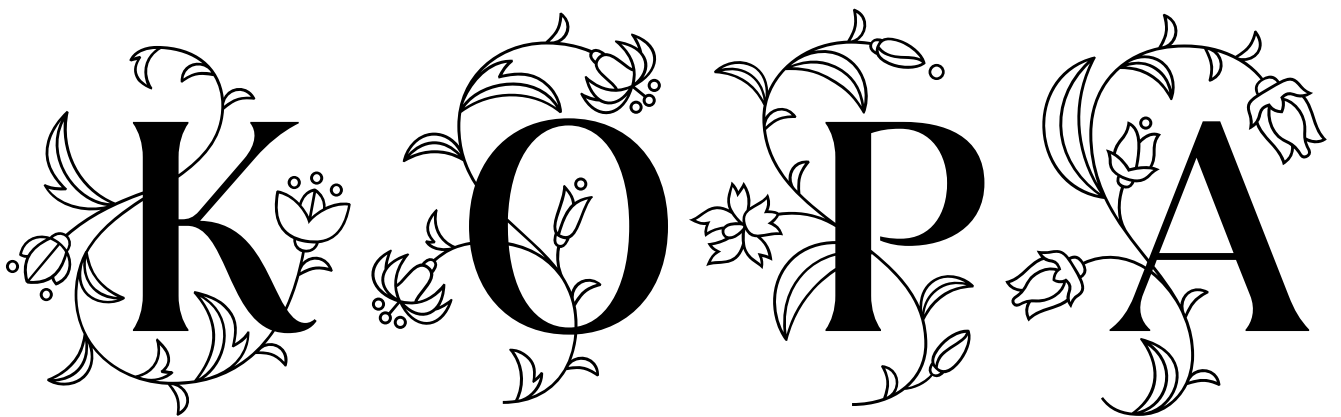
TT Ramillas Initials Medium 110 pt