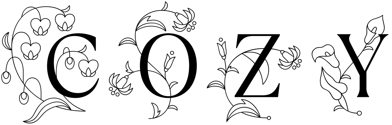
TT Ramillas Initials Light 115 pt