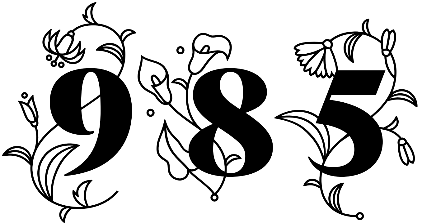
TT Ramillas Initials Black 180 pt